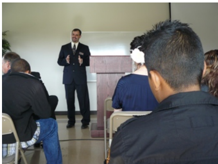
In the Spanish service of a church in PA