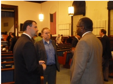
Talking after a service in a church in PA