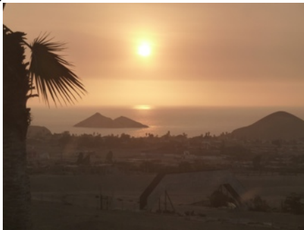
Sunset in Lima, Peru