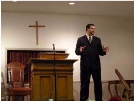
Preaching in South Hope, ME