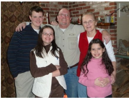
Our kids with the Callahans in Maine