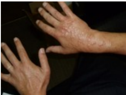
Jeff (aka "bug bait") - over 100 noseum bites