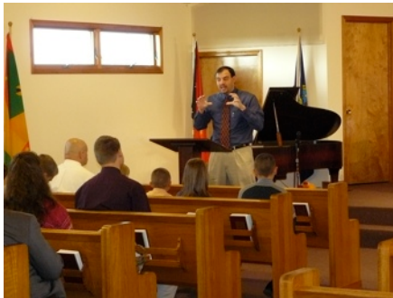
Speaking in the school's chapel