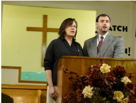
Singing a duet

As we were near the home office of our mission board, I took two days to work on a couple projects enhancing the mission board's website. We have added a Donations page ( www.odbm.org/index.php/donations ) which describes the various ways that contributions can be made to the home office as well as to the individual missionaries.