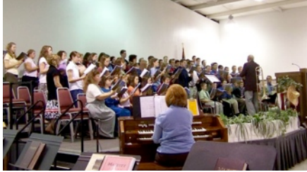
Choir at Emmanuel Baptist Church