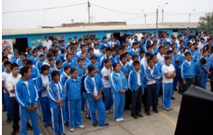
At a public school

We also had the opportunity to go into 10 different schools doing a total of 13 presentations. Some of the schools were Christian schools but others were public or private schools. One of the public schools was a school that we were denied access to two years ago but this year the Lord allowed us to present the gospel to them. Another public school did not allow us to do a general presentation as we normally do but requested that we would go into the individual classrooms of their seniors to do the presentation. We wound up doing our presentation in 4 classrooms with smaller groups of students, which made it more personal.