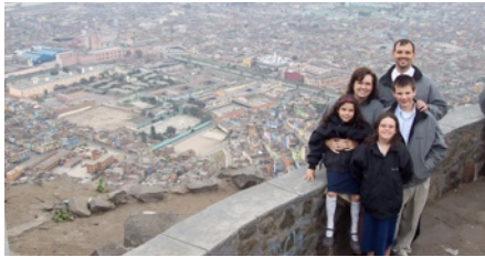
Our family overlooking Lima