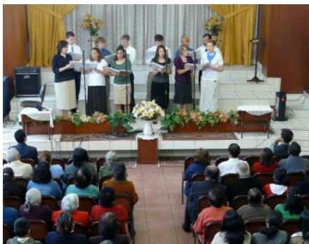
The team in a church presentation

From June 13th through the 30th, we took a total of 15 people including my entire family to Lima for a short term mission's trip. We documented the trip on my website ( www.surrett.org/trips/y09/ ) with a video summary as well as a day-by-day account with pictures if you would like additional information. Here is a brief overview of the trip.