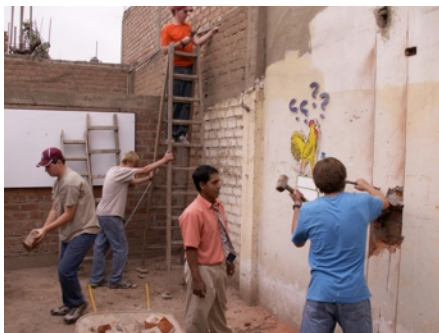
Tearing down walls to make new

We provided a couple of churches with some limited funds and unskilled labor as they provided additional funds and guidance as to what needed to be done. We assisted with taking down walls, and putting up new walls; scraping and painting walls; hauling tiles; mixing cement; digging holes for concrete pillars and filling them with cement; cutting, bending, and assembling rebar; and general cleaning and organizing.